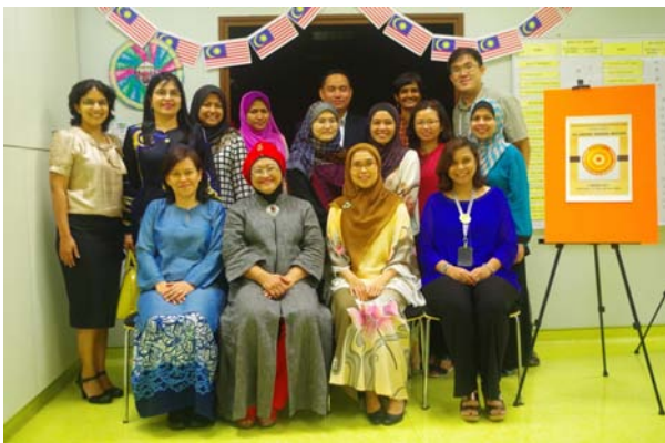
(MARP: Local Organising Committee-Main committee members)